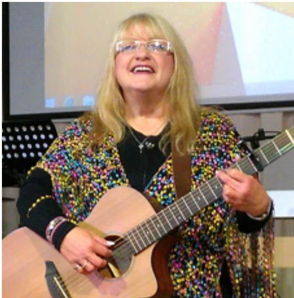
PEOPLE DEVoured ALL THAT THE LORD HAD ME SHARE IN HEIDELBERG, SOUTH AFRICA!