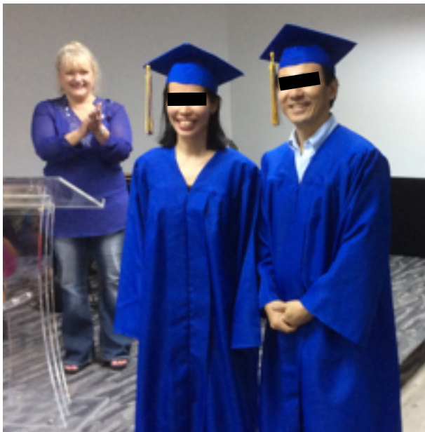
CBC HONG KONG JUST GRADUATED ITS FIRST TWO CHINESE STUDENTS!

After the students left to return to Hong Kong, I went to Heidelberg, South Africa to minister at Langeberg Christian Fellowship and CBC South Africa.