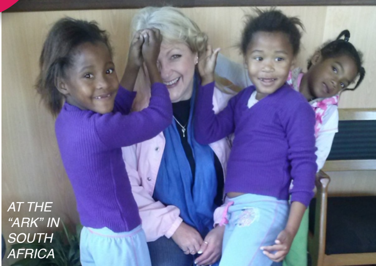
AT THE "ARK" IN SOUTH AFRICA